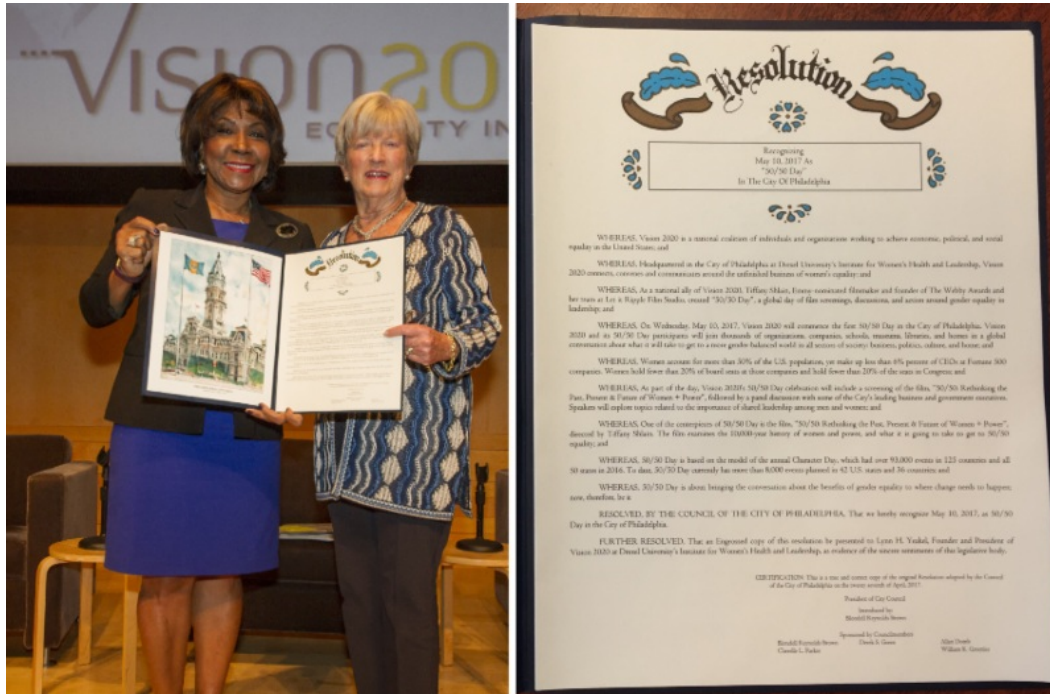
Councilwoman Blondell Reynolds Brown presented Vision 2020's Lynn Yeakel with a Resolution from the City of Philadelphia that proclaimed May 10, 2017, as 50/50 Day.

As part of 50/50 Day in Philadelphia, Vision 2020 teamed up with Councilwoman Blondell Reynolds Brown of Philadelphia City Council. The councilwoman, who participated on a panel of business and government leaders, brought with her an official resolution proclaiming May 10 as 50/50 Day throughout Philadelphia – the only major U.S. city to make such a declaration.