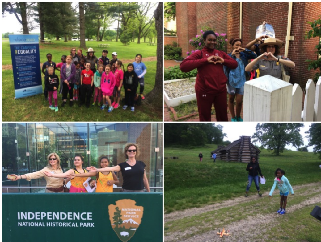
Girls on the Run teamed up with Vision 2020 to be the first to test the HERstory Hunt, a women's history scavenger hunt that will formally launch in August at two national parks in the Philadelphia region. The program will expand to more parks within the National Park Service in the coming years.

One of Vision 2020's goals is to educate youth about the contributions of women throughout history. As one strategy to achieve that goal, Vision 2020 created the HERstory Hunt, a hands-on women's history scavenger hunt that seeks to teach girls and boys to go beyond the traditional telling of history to find the underrepresented voices of the past, and especially to find the places where women have served as leaders or important historical figures.